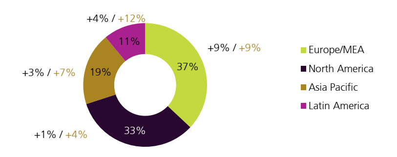
Growth in DKK / Growth in LCY